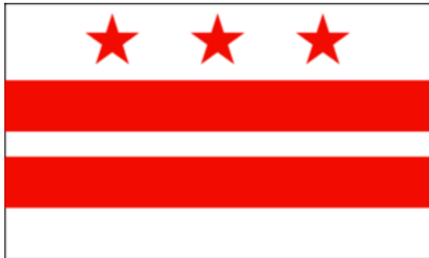
Flag of the city of Washington D.C.

The District of Columbia is not a state or State of the Union and therefore cannot be considered to be included in any definition of a state or State. In fact, the city of Washington D.C. is an independent city-state and its flag represents the three city-state empire of the city of Washington D.C., the city of London, and Vatican city. The City of London is not to be confused with London, England, and the City of Washington D.C. is not to be confused with the District of Columbia or the United States.